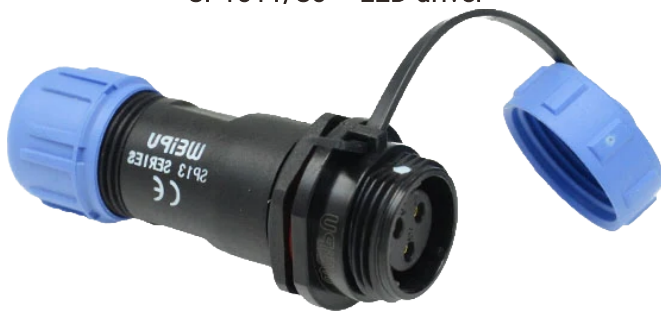
SP1311/S3 – LED driver