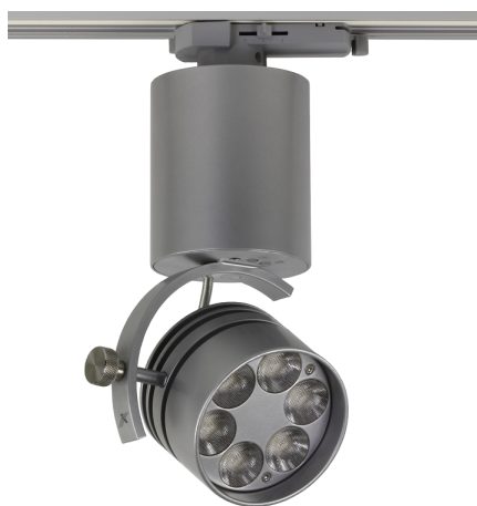
PxArt+ 06 Track