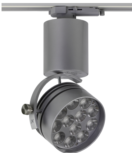
PxArt+ 12 Track